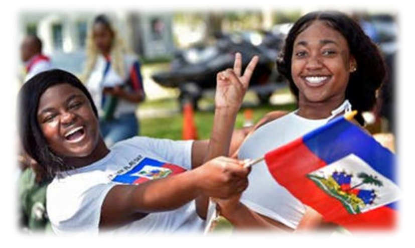
May 18<sup>th</sup>, 2023